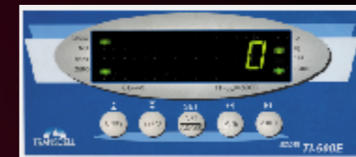
□ weight scale display