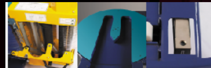
□ open type carriage for easy film threading.