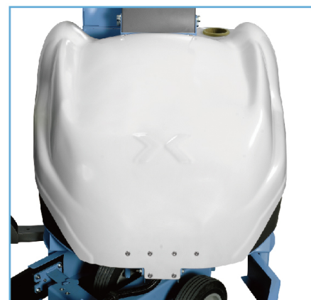
▲ NEW TOP COVER