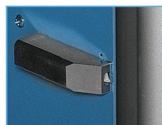
▲ AUTOMATIC FILM CUTTING (EXP-630)