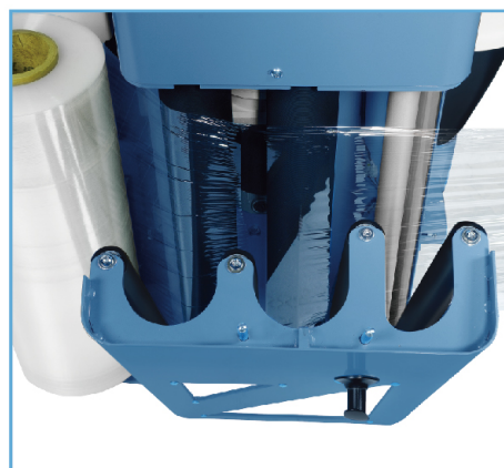
▲ EASY THREAD (EXP-630)