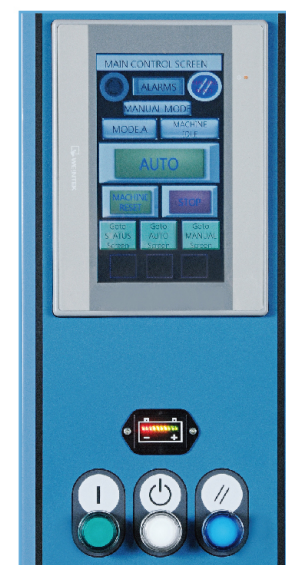
▲ TOUCH SCREEN CONTROL PANEL (EXP-630-PLUS)