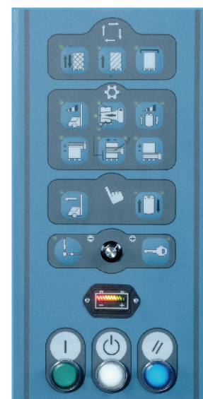
▲ CONTROL PANEL